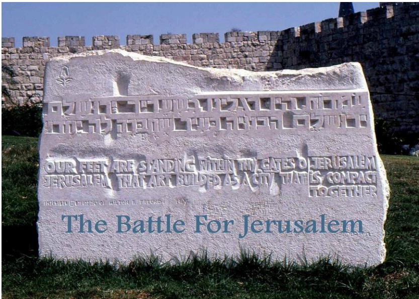
This stone stands by the walls of Jerusalem.

Jesus for 30 pieces of silver. Zech 11:10-14. These false shepherds and false prophets are set in contrast to the true shepherd. Zech 13:1-7. (See also Ezekiel 34:17-31, 36:24-28, 37:24, 39:21-29.) Zechariah ends with the triumphant declaration that Jerusalem will be inhabited again and a great fountain of cleansing will be opened, and the people will have their eyes opened to see Jesus who was pierced and that the remnant of people will not be cut off even though all nations come against Jerusalem; it will be delivered and become the Holy city to which all Gentiles will come and worship the King. It will become the head nation of the earth.